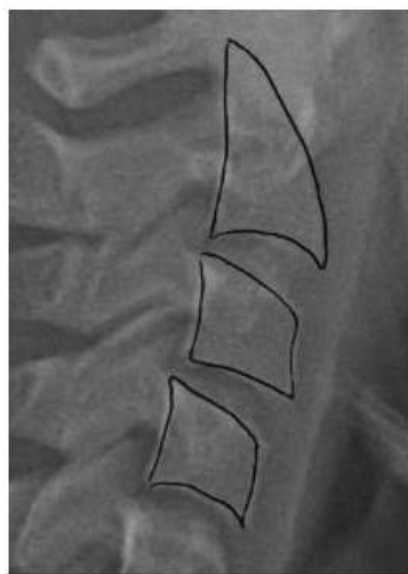
CS2, Kategori 1 (Stage Initiation)