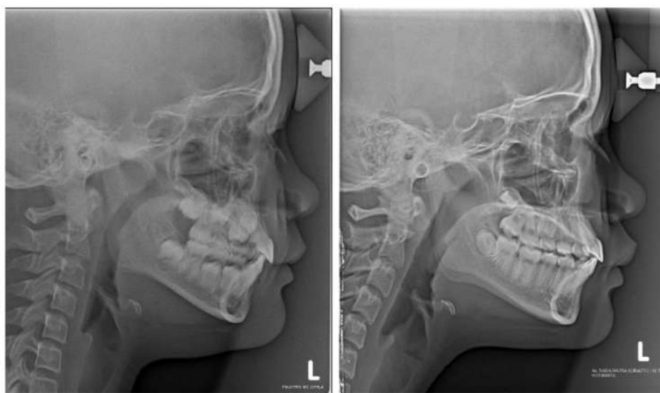
Fig 4. Lateral cephalometry before treatment (a) and after treatment (b)